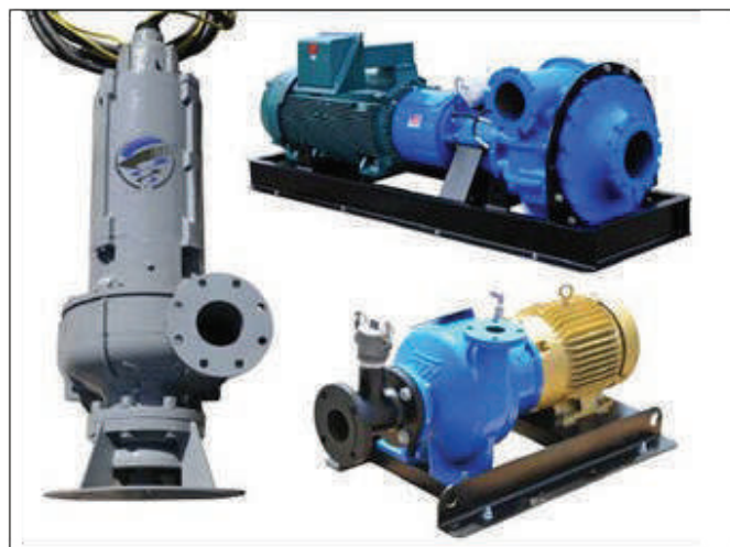
*Typical Deployment Photo. Dredge pumps can be deployed vertically or horizontally. Photos for general guidance. Contact us for further details.