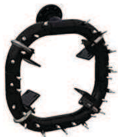
WATER JETTING RING

Enhance your pumping and dredging abilities with our premium add-ons. Our specialized equipment is designed to optimize your project by increasing solids production of your pump. Attachable add-ons are easy to install as the need arises. Contact us today to learn about the best add-ons available for your project.