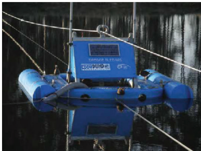
*Typical Attachment Photo. Photos for general guidance. Contact us for further details.