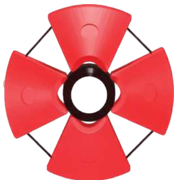
8 inch pipe 4 float units