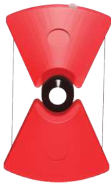
4 inch pipe 2 float units