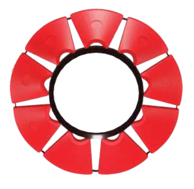
26 inch pipe 9 float units