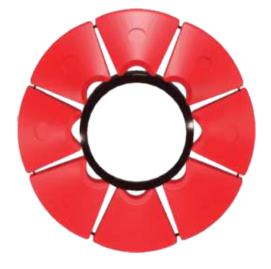
20 inch pipe 8 float units