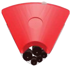
Hose, Pipes, Power Cables, Umbilicals