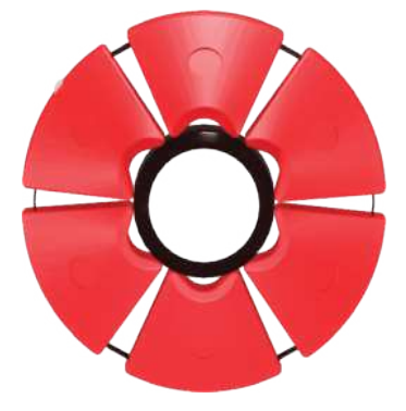
12 inch pipe 6 float units