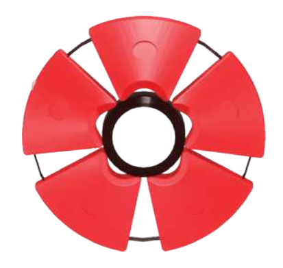
10 inch pipe 5 float units