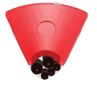
Hose, Pipes, Power Cables, Umbilicals